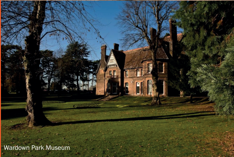
Wardown Park Museum