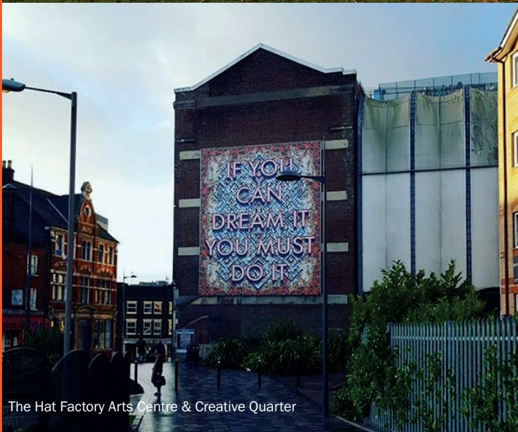
The Hat Factory Arts Centre & Creative Quarter