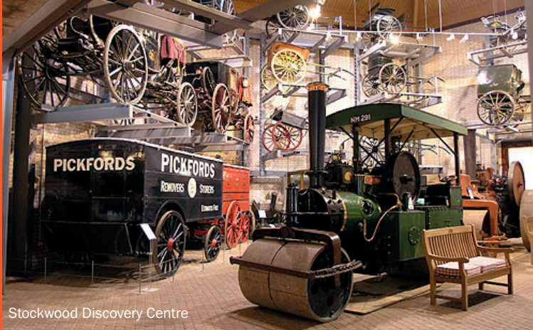
Stockwood Discovery Centre